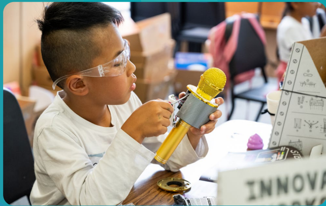
A program participant explores the inner workings of their microphone.