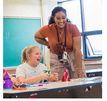
Are you an educator who has a passion for encouraging children to explore their creative potential? Register now to instruct a Camp Invention<sup>®</sup> program this summer and provide exciting, hands-on #STEM activities to students in your community! https://www.invent.org/ camp-instructor