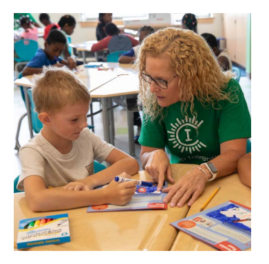
Interested in a fun, handson teaching opportunity this summer with Camp Invention<sup>®</sup>? Visit our website to learn more! <u>https://www.</u> invent.org/camp-instructor

Below you will find prewritten social media posts to promote your local Camp Invention program through your Facebook Event page, as well as personal and/or school district social media profiles.