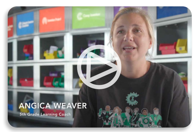
Camp Invention Insights From Educators