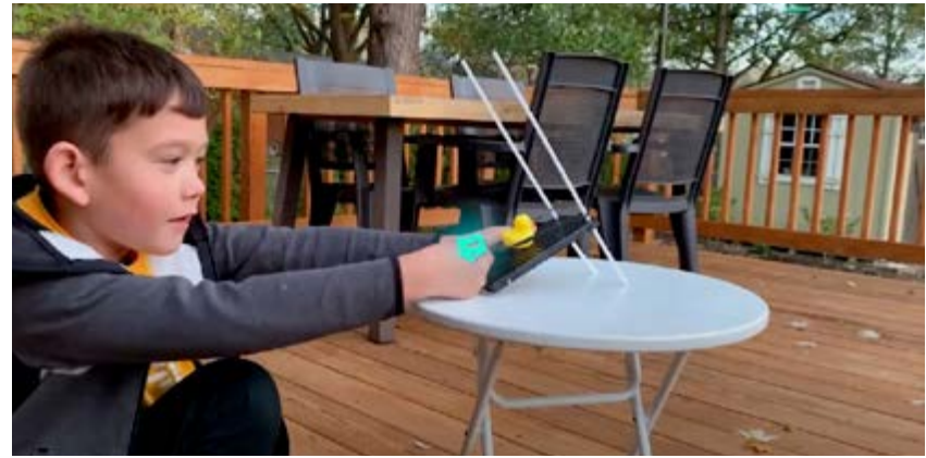
Explore STEM at Camp Invention

For additional resources to promote your local program, be sure to check out the full Camp Invention Promotional Guide on the Resource Center!