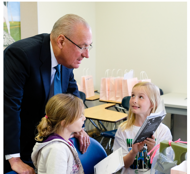
NIHF Inductee Edmund O. Schweitzer III visits with participants at Camp Invention.