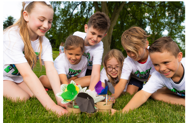
Camp Invention participants work together to design eco-friendly flowers.

An inventor's work is never finished because they know that progress and improvement are always possible. We have been privileged to instill this spirit of optimism in millions of students across the country and believe that by using the Innovation Mindset, together we can invent a better future.