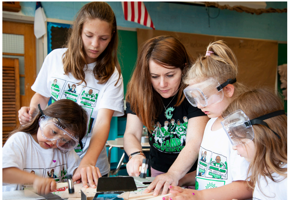
A Camp Invention Instructor helps her students build their inventions

Research has shown that gender-related stereotypes begin to develop in children at around 4 years of age. 12 These presumptions are especially harmful to young girls who very early on in their education begin to question their aptitude in math and science. Though there exists a national push to close the innovation gender gap by introducing high school STEM programming to young women in this age group, it simply begins too late. Instead, educators and mentors must start providing girls with playful introductions to the world of technology and engineering beginning in early childhood.