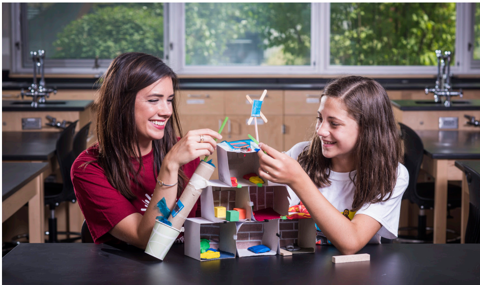
A Camp Invention Instructor assists a camper with the Mod My Mini Mansion™ activity