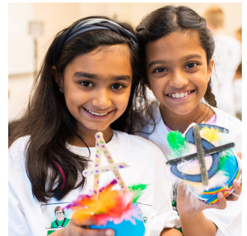
Two Camp Invention participants show off their DIY Orbot™ designs

In order to encourage young women's innovative development and grow their much-needed presence in STEM industries, it is essential to provide exposure and support for them in early education. Educators and mentors must actively work toward dispelling gender stereotypes and demonstrate that women can and do thrive in STEM careers.