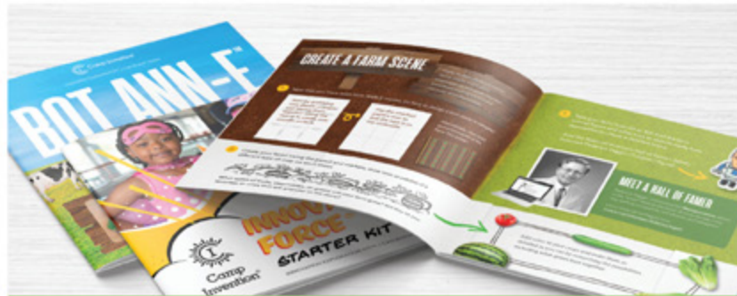
Bot ANN-E & Innovation Force: Starter Kit