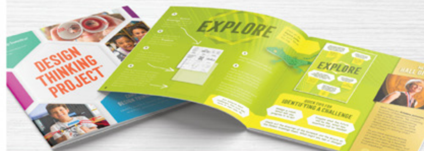
Design Thinking Project