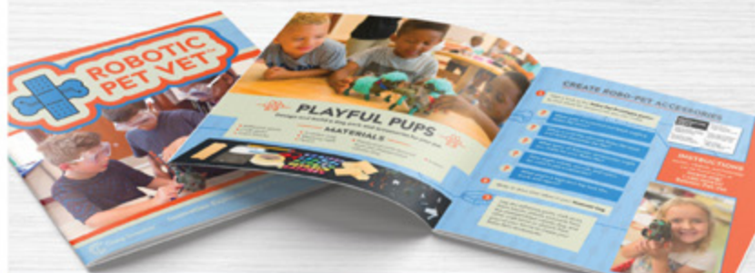
Robotic Pet Vet