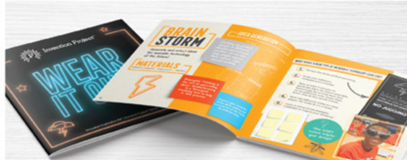
Wear It Out