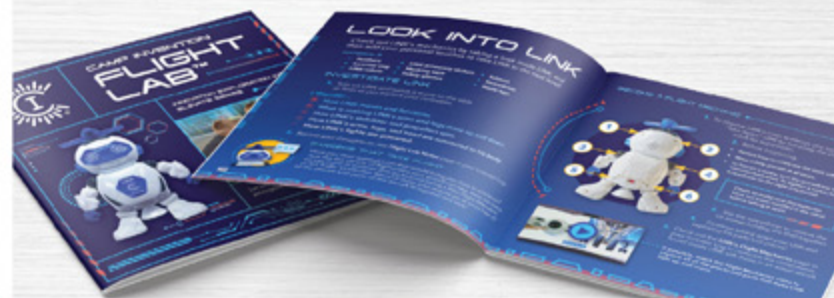
Camp Invention Flight Lab