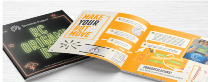
RC Origami Bot