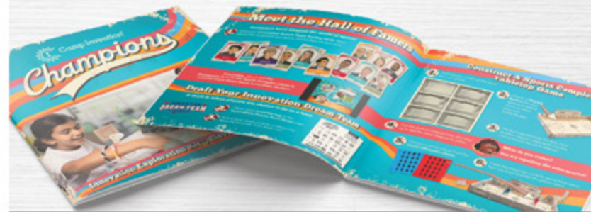
Camp Invention Champions