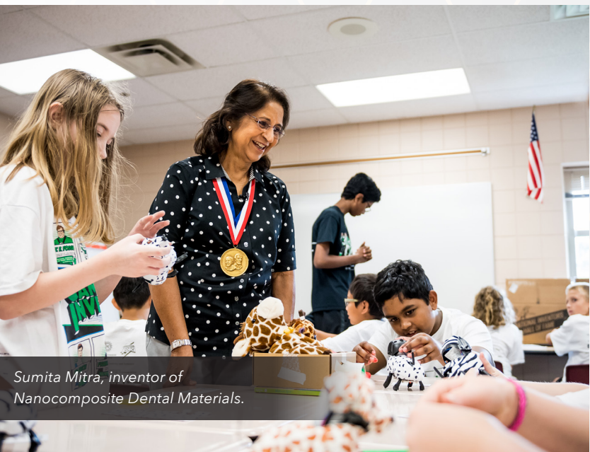
Sumita Mitra, inventor of Nanocomposite Dental Materials.