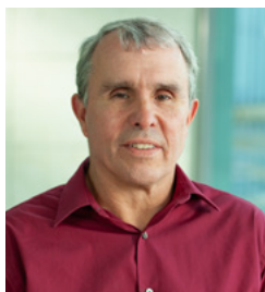
ERIC BETZIG Photoactivated Localization Microscopy (PALM)