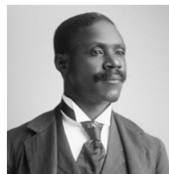
GEORGE WASHINGTON MURRAY Agricultural Machinery