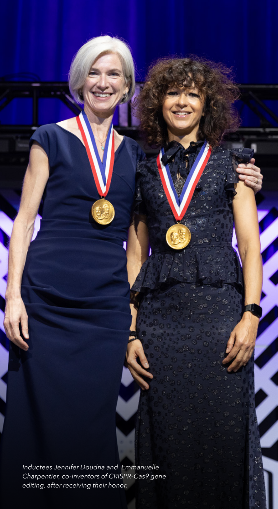
Inductees Jennifer Doudna and Emmanuelle Charpentier, co-inventors of CRISPR-Cas9 gene editing, after receiving their honor.