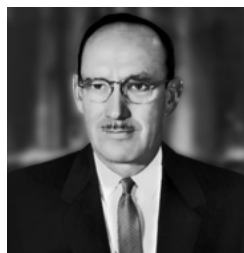
JOSEPH- ARMAND BOMBARDIER Snowmobile