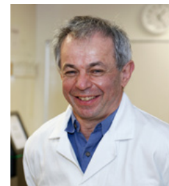
DAVID KLENERMAN Sequencing-by- Synthesis (SBS)