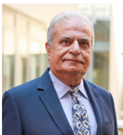
ASAD MADNI MEMS Gyroscope for Aerospace and Automotive Safety