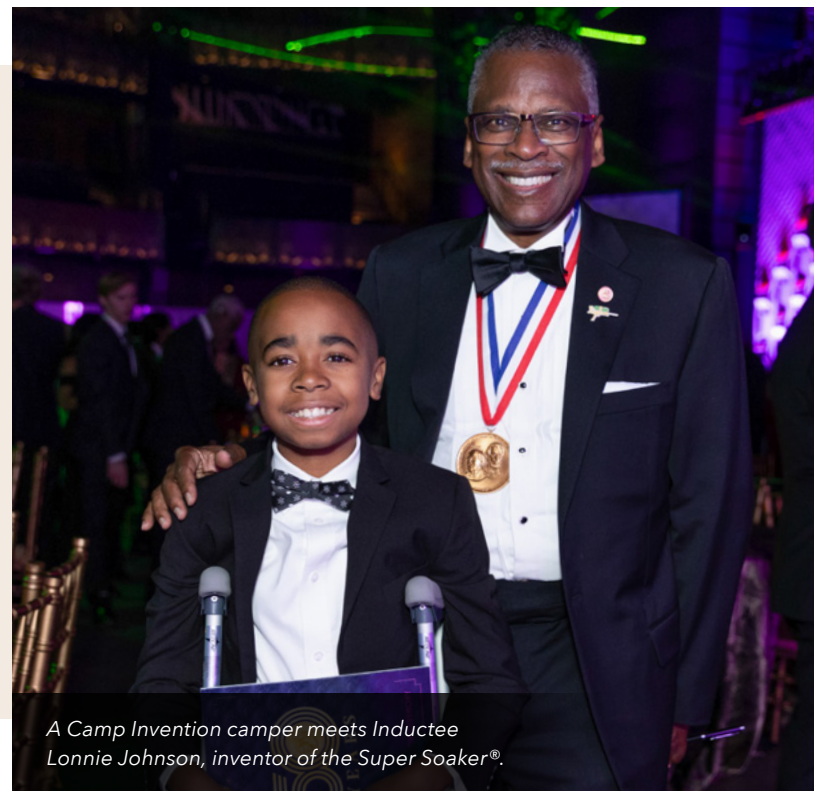
A Camp Invention camper meets Inductee Lonnie Johnson, inventor of the Super Soaker®.