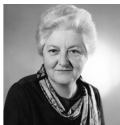
ALICE STOLL Fire-Resistant Fibers and Fabrics