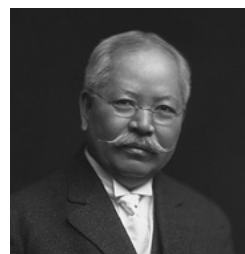
JOKICHI TAKAMINE Adrenaline (Adrenalin®)