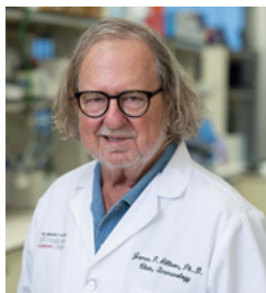
JAMES ALLISON Immune Checkpoint Blockade Therapy