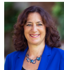
ANDREA GOLDSMITH Adaptive Beamforming for Multi-Antenna Wi-Fi