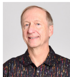
HARALD HESS Photoactivated Localization Microscopy (PALM)