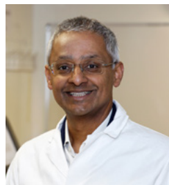
SHANKAR BALASUBRAMANIAN Sequencing-by- Synthesis (SBS)