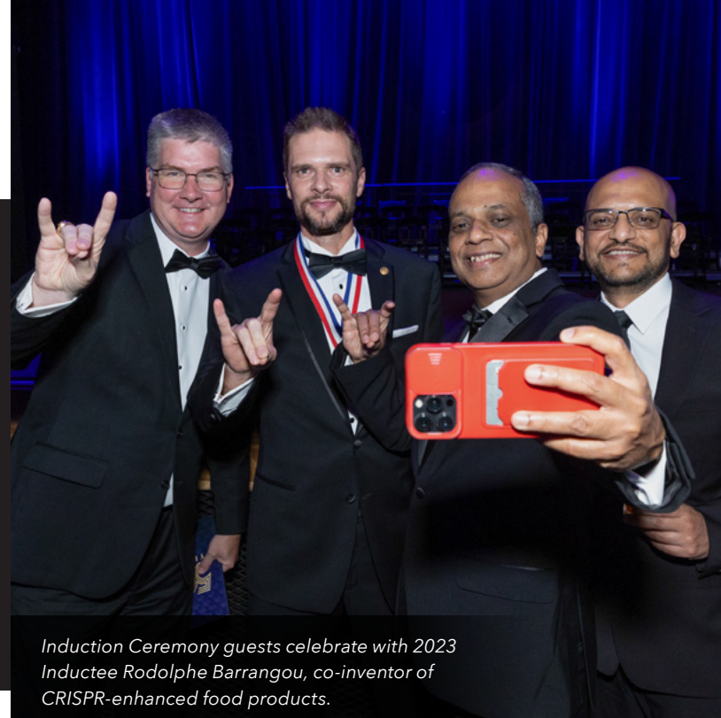
Induction Ceremony guests celebrate with 2023 Inductee Rodolphe Barrangou, co-inventor of CRISPR-enhanced food products.

Kathi Vidal , Under Secretary of Commerce for Intellectual Property and Director of the United States Patent and Trademark Office