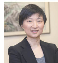
XIAOWEI ZHUANG Stochastic Optical Reconstruction Microscopy (STORM)